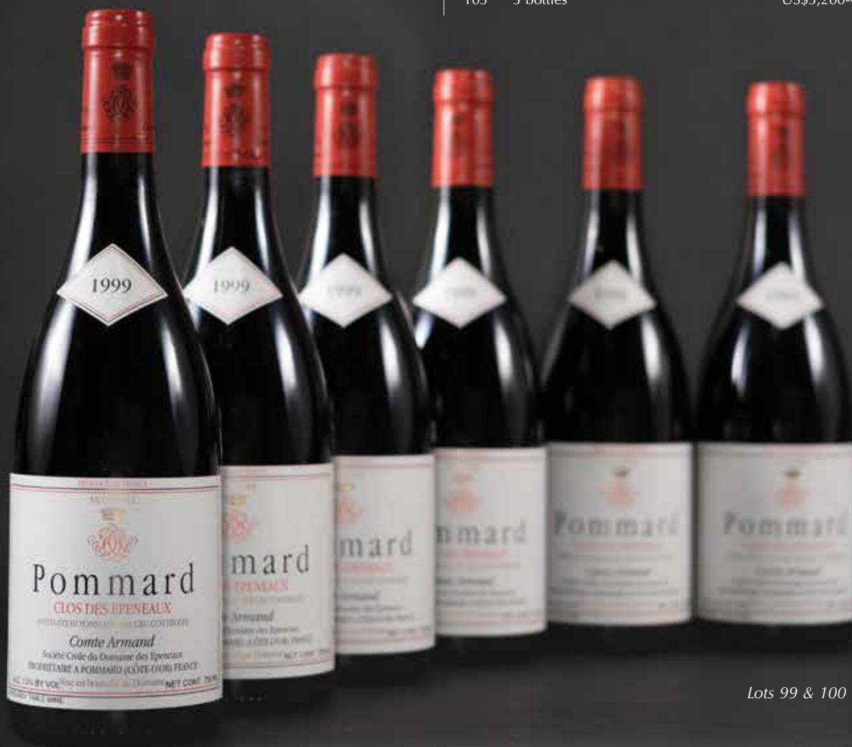
Lots 99 & 100