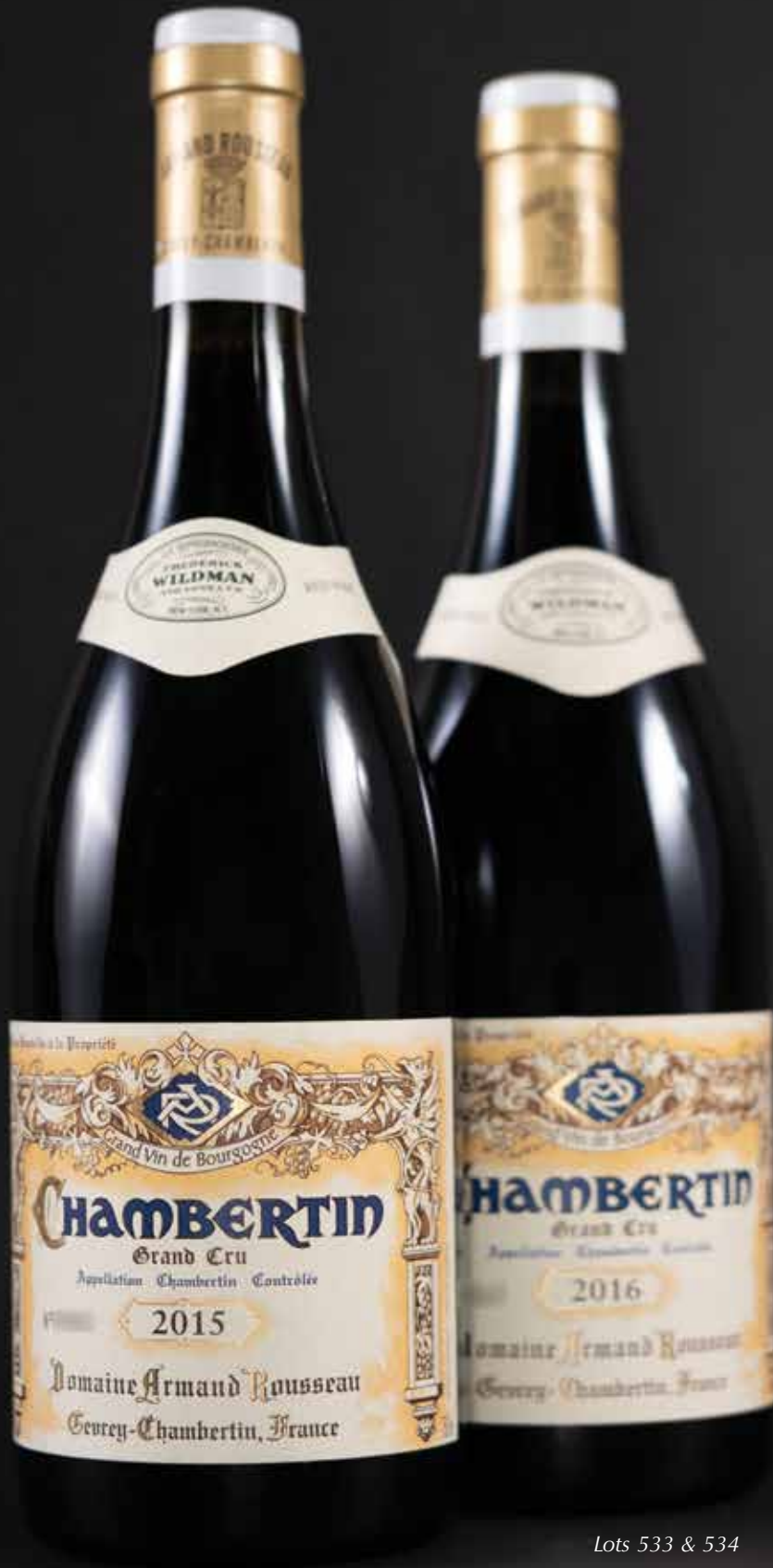
Lots 533 & 534